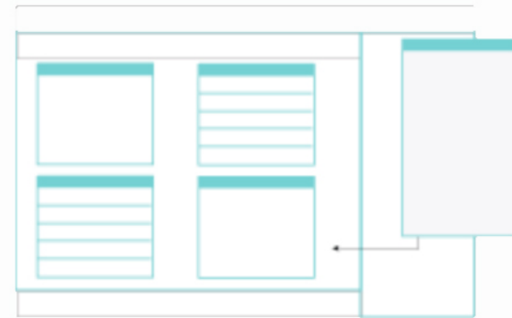
D3. Unstructured data entry into structured / categorized data