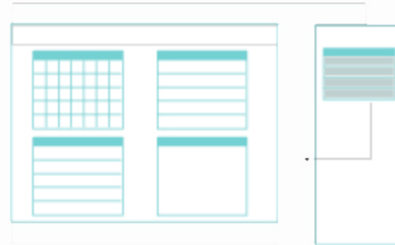
D2. All summary view - as an option for a Home page